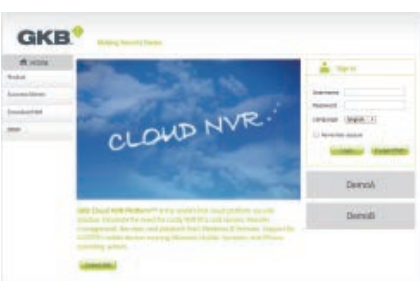
GKB Cloud NVR Platform

Cloud NVR can remotely monitor and manage cameras from any device. Log in is as simple as entering your username and password. “The Link” can now remotely manage IP cameras easier than ever.