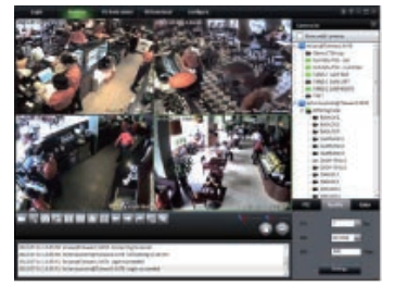
GKB Envoy™ Viewer11

The operation of the entire system is managed and coordinated centrally with “Viewer 11 & NVR Server,” two comprehensive and intelligent security platform software.